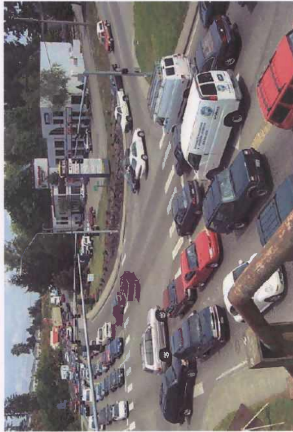
EXHIBIT 144 PAGE 1 OF 20