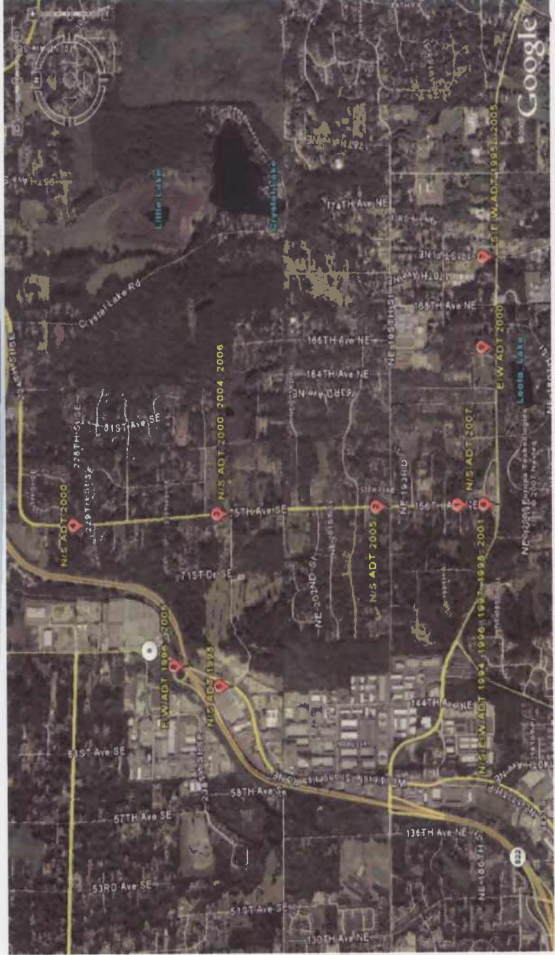
EXHIBIT 144 PAGE 4 OF 20