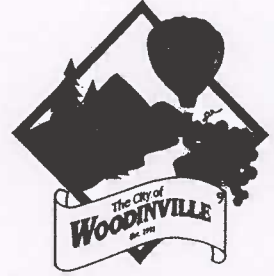
EXHIBIT 158 PAGE 1 OF 15

"Citizens, business and local government, a community commitment to our future."