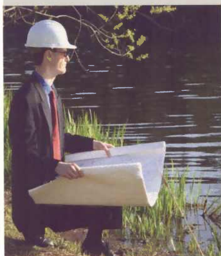
EXHIBIT 161 PAGE 1 OF 196

Prepared by Concerned Neighbors of Wellington